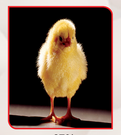
< 67% Low

This chick will be active and ready to feed and drink when placed on farm