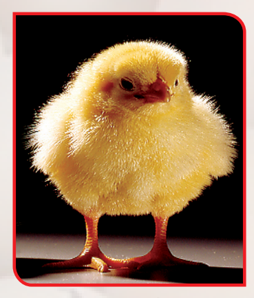
> 68% High

This chick will be lazy and not ready to feed and drink when placed on farm.